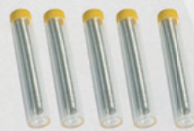
PPTK0038 Solder Rosen (5 Pack)