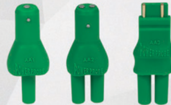
PPTK0006 Light Bulb Adapter Connector Kit