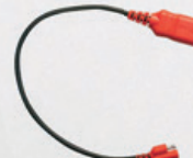
PPTK0044 Motorcycle Battery Tender Adapter