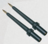
PPTK0024 3 in Tip (2 Pac)