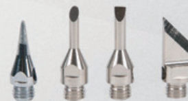
PPTK0041 4 Piece Tip Set: Chisel, Wedge, Hot Knife, Solder Tip PPSK ONLY