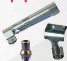
PPTK0018 Heat Shrink Tip Set: Heat Blower, Heat Shrink, Heat Shrink Holder PPMT ONLY