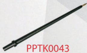
PPTK0043 6 in Probe Tip