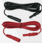
PPTK0002 DMM Adapter Leads Kit