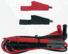
PPTK0001 DMM Leads Kit