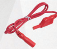
PPTK0004 Wire Extension 3 FT Banana Jack