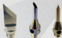
PPTK0019 PPSK & PPMT Tip Set: Hot Knife, Chisel, Wedge Type