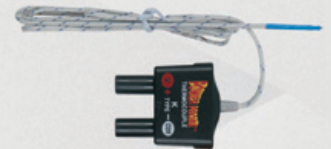
PPTK0036 Thermocouple Probe